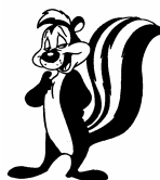
PEPE LE PEW

THE MARK shown above, Registration No. 7486 , has been renewed in the name of WARNER BROS. ENTERTAINMENT INC. (WBEI), of 4000 Warner Boulevard, Burbank, California 91522, United States of America, as of the 6 th day of November, 2006, in respect of international Class 16 for printed matter, newspapers, periodicals, comic books, books, paper articles, stationery, writing tablets and writing materials, crayons, markers, coloured pencils, chalk and chalkboards, decalcomania, heat transfers, posters and photographs, instructional and teaching materials, paper napkins, paper doilies, paper placemats, crepe paper, invitations, paper table cloths, paper cake decorations, all included in Class 16, of which it has been used. The mark shall remain valid for a period of ten years until the 6 th day of November, 2016, upon which it can be renewed for further periods of ten years.